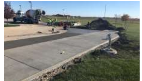
New pavement on the southwestern part of parking lot-east entrance/exit