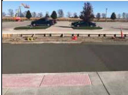
Southeast Entrance/Exit drive up. New pavement as of 10/23/18