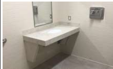
Family Bathroom as of 10/23/18