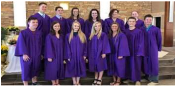
Congratulations to St. Thomas Aquinas Catholic Church Graduating Senior Class